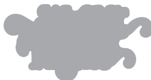
silent_night 2.5" wide