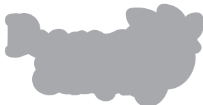
peace_on_earth 2.1" wide