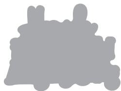
hark_herald_angels 1.9" wide