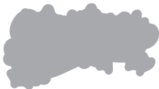
christmas_blessings 2.5" wide